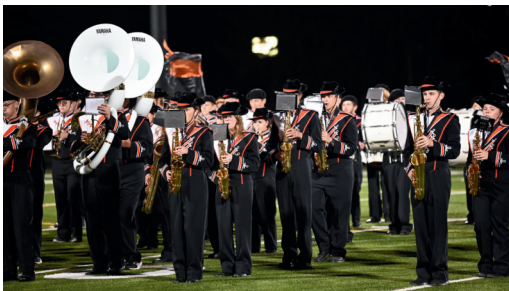
The Ripon High School Marching Band performing their Homecoming halftime show The Music of Bruno Mars .

* Same group of students from the fall last year